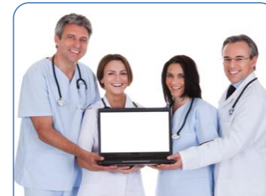
Health IT Workforce