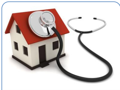
Patient Centered Medical Home (PCMH)